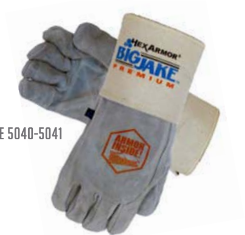
BIG JAKE 5040-5041