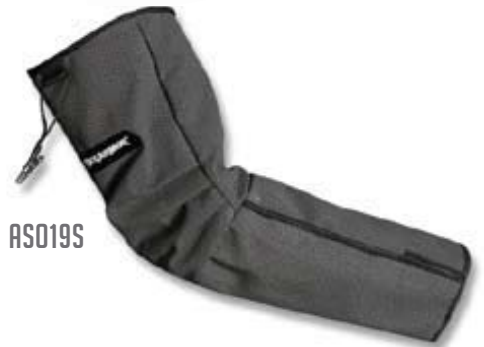
ARM SLEEVE AS019S